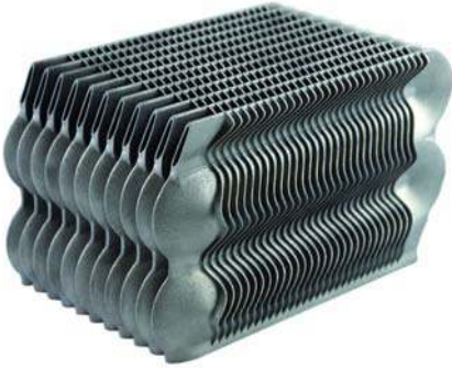
Fig. 2. RVS 316 heat exchanger, which has been printed in 3D.

Another big advantage, is that one has unlimited freedom in the geometry of the product, both internally and externally. One can even apply cooling channels, which can be spiral shaped. In Fig. 2, you can see a stainless steel heat exchanger, which has been 3D printed.