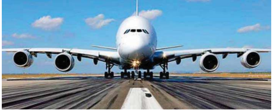
Fig. 4. An airbus A380. of the 140 tons of titanium required, approximately 90% is chipped.

When casting metal parts, one first needs to make models or scallops, so that the melted metal takes its desired form. When forging, it is mainly matrices that are the basis of achieving the desired product. With Additive Manufacturing, no costly casting moulds and/or forge matrices are needed so that the technique has become interesting mainly for making smaller series. Another advantage is that a product can be made available relatively quickly for a customer – a short-time-to-market'