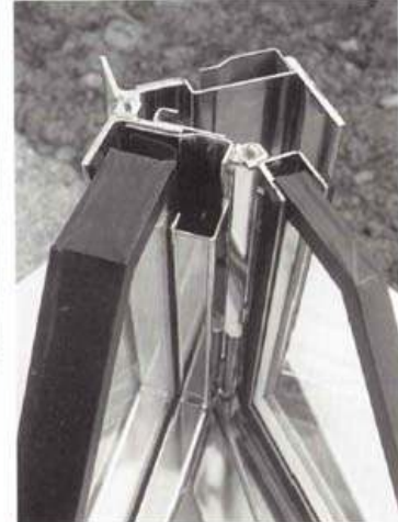
Window with windowframe of stainless steel (AISI 316Ti) for the residence of king Fahd of Saudi-Arabia