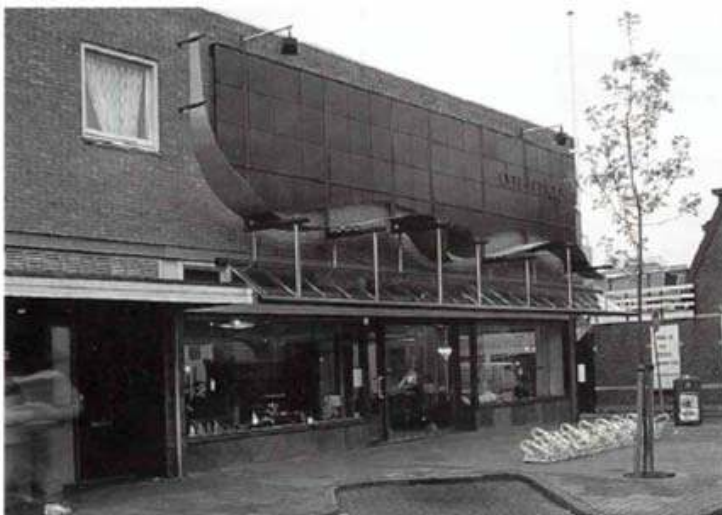
Awning shop – Alphen a/d Rijn – The Netherlands. The corrugated parts are of stainless steel

The aggressiveness of water can change considerably according to its chemical composition.