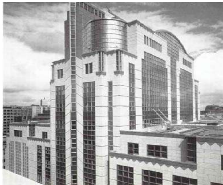
One American Square Tower, London. In this project stainless steel is used as curtain wall at the top of the building (AISI 316), for the fixing of the granite (AISI 304) and the snap-in-construction (AISI 316)

All not amalgamated or little amalgamated types of steel have in common that they react with oxygen in presence of an electrolyte. (An electrolyte is a substance, like water, whose