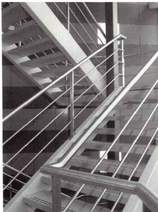
Banisters of stainless steel. The balusters exist out of two fixed flat bars welded at the inside.

Alloying steel with the chrome element changes this unfavorable property. When the chrome content in iron becomes 12-13%, the passivity becomes so good, that the alloy does not rust in water and air under normal circumstances. This happens because a thin and resistant oxide layer forms on the surface of steel, which takes the same volume as the underlying metal. Steel becomes perfectly sealed. It is important, though, that oxygen is always present to form and keep this chrome oxide coating intact. This layer has to be perfect, so that no corrosion origins in the pores. In the oxidizing environments such coating origins very quickly on a clean metallic surface. If the surface is dirty or contains for example residues of welding slag, the formation of this oxide coating is significantly prevented and the risk of corrosion rapidly increases. Addition of molybdenum, as well as chrome, provides for extra improvement of the corrosion resistance.