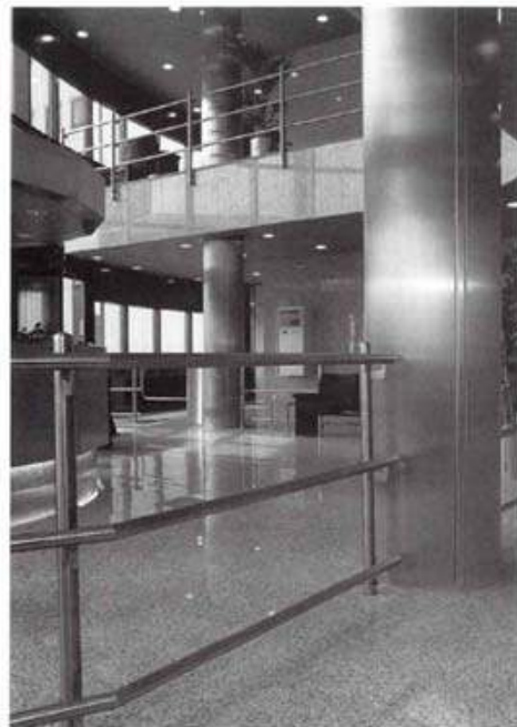
Europagebouw – Haarlem – The Netherlands Two stainless steel sheets are covering two concrete pillars

Molybdenum has the same effect on the structure as chrome has and mostly it increases the corrosion resistance both of ferritic and austenitic stainless steel. In some countries this